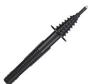
Test probe with banana socket; 5 kV; black WASONBLOGB2