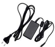
Meter power adapter (type Z-7) + 230 V power cord WAZASZ7