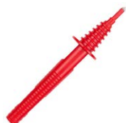
Test probe with banana socket; 5 kV; red WASONREOGB2