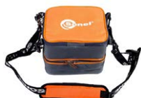
M-8 carrying case WAFUTM8