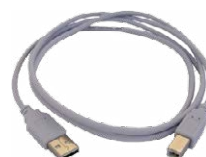
USB cable WAPRZUSB