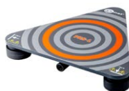
PRS-1 resist- ance test probe WASONPRS1