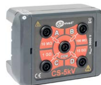
CS-5kV cali- bration box WAADACS5KV